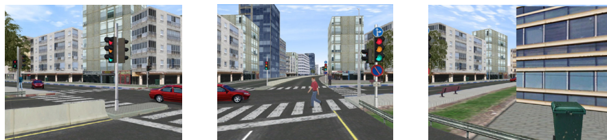
The generic city environment presented in the Dome setting from a side view.

"VR-Forces, B-HAVE, and VR-Vantage made the perfect formula in creating our virtual world. No integration work was needed, just configuration," said Dr. Tal Oron-Gilad,