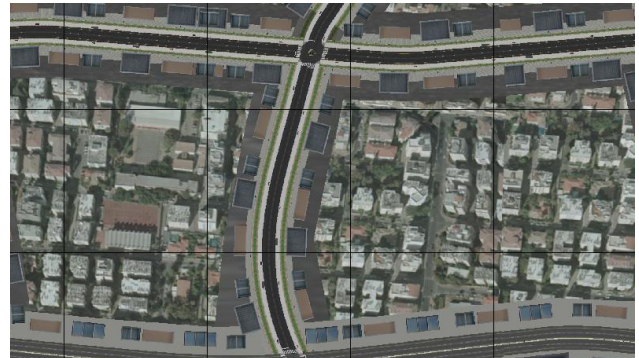
The generic city environment presented in the Dome setting from a bird's eye view.

The significance of this project stems from its engagement in a novel training methodology involving virtual reality capabilities. By addressing child-pedestrians' road safety behavior in off-road settings, the Human Factors Engineering is promoting the utilization of HP scenarios as a tool to train child-pedestrians to detect and predict hazardous situations.