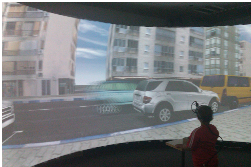
Simulated environment from a child-pedestrian's point of view.

"Only a COTS solution like the one offered by MÄK could meet the budget constraints of our project. It was the perfect all-in-one solution at the right price," said Oron-Gilad.